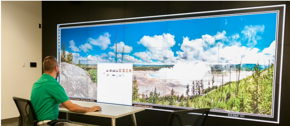
Figure 1. The 34.5 million pixel display wall used in the study.