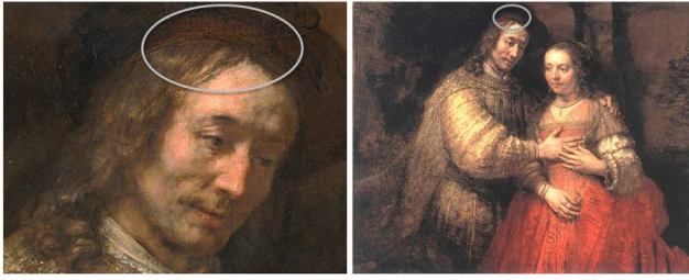
Figure 2. P5 discovered a yarmulke under a hat in The Jewish Bride [26].